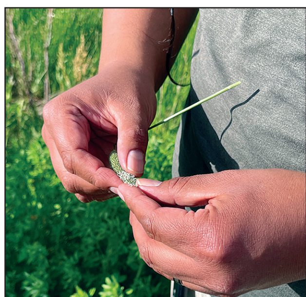
Close up of garrison's creeping meadow foxtail.